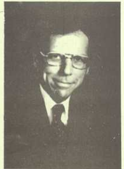
Governor William Winter